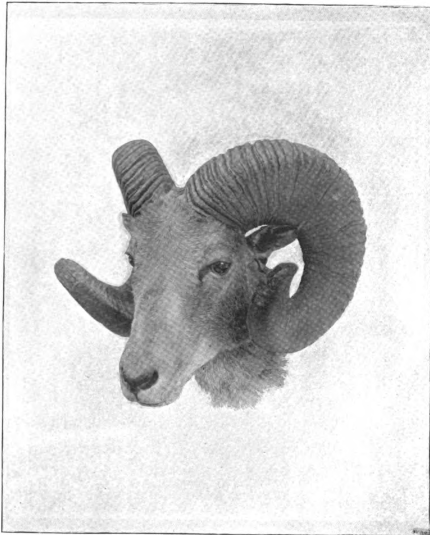
NYAN OR OVIS AMMON. (Length of_Horns 42 inches.)