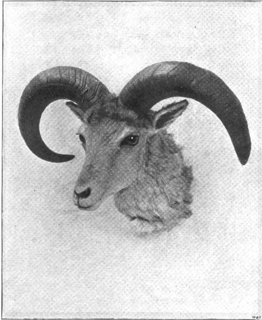
NAPOO OR BURHEL. (Length of Horns 24 inches.)