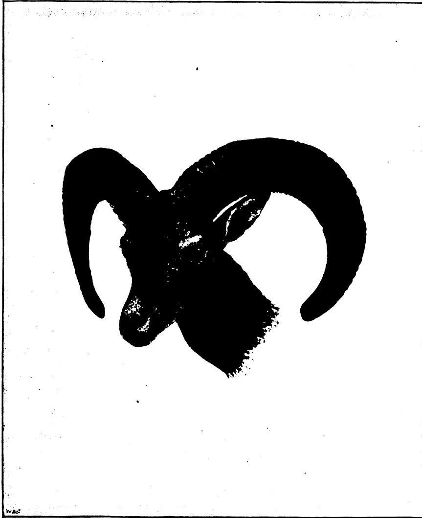
SHĀPOO OR OORIN. (Length of Horns 27\frac{1}{2} inches).