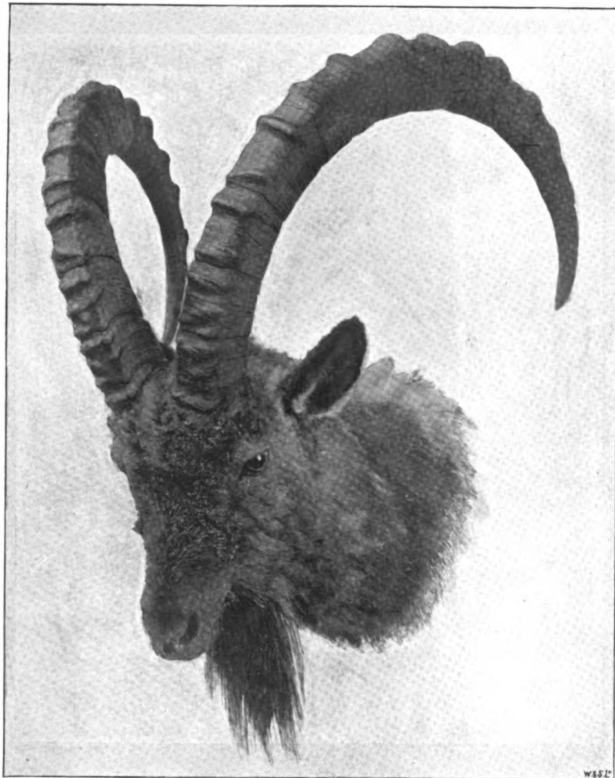
"SKYIN" OR IBEX. (Length of Horns 42½ inches.)